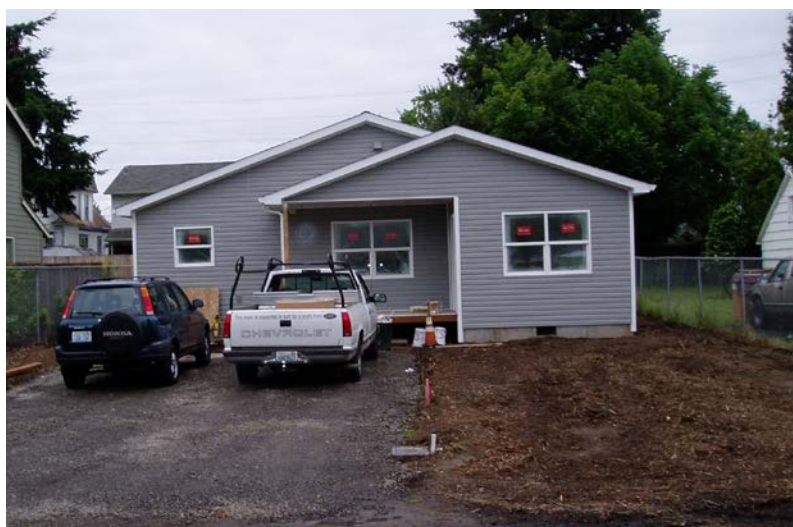
Habitat for Humanity House

Tenants may receive case management, transportation assistance, and/or meal assistance.