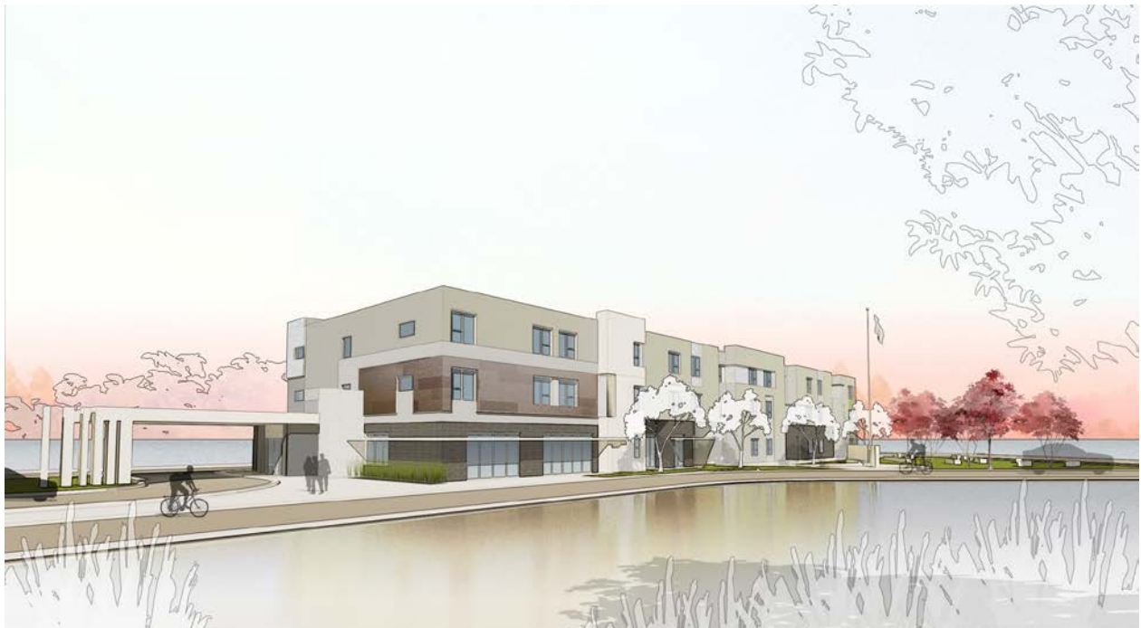
Affordable Housing Solutions – Freedom’s Path Housing

Tenant-based rental assistance for approximately 32 households who are at or below 50% of AMFI. Tenants can receive assistance and case management for up to 24 months.