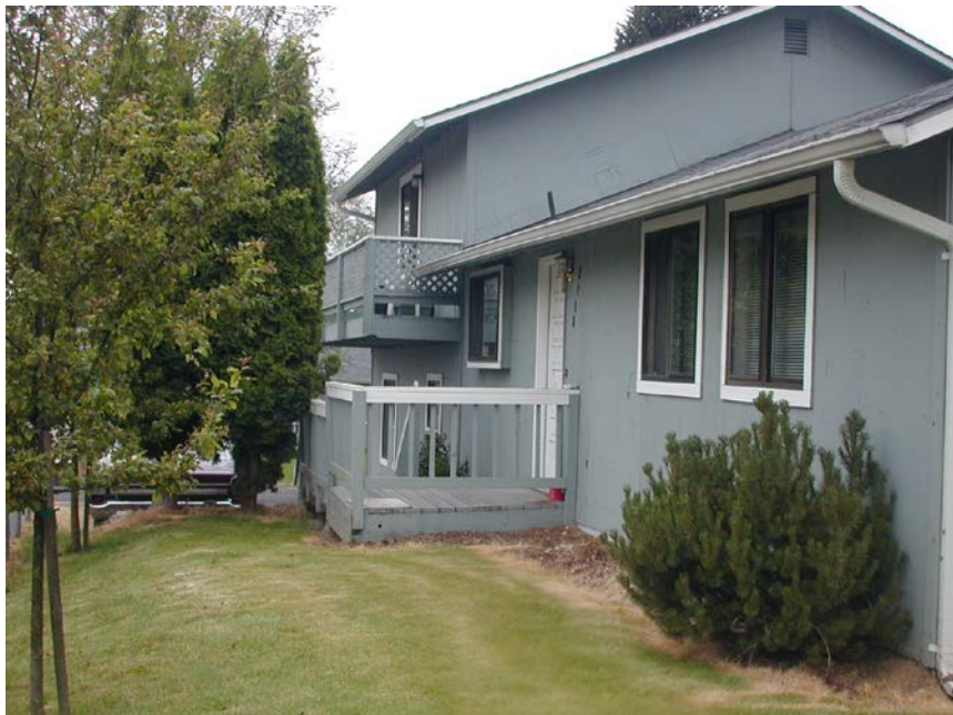
99th Street House

Acquisition and rehabilitation of a house for use as a group home for ARC of Clark County clients. Located at 13720 NE 18th Street.