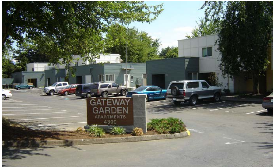
Gateway Garden (previously Bethea Park)

Funds for operating costs of a Community Housing Development Organization.