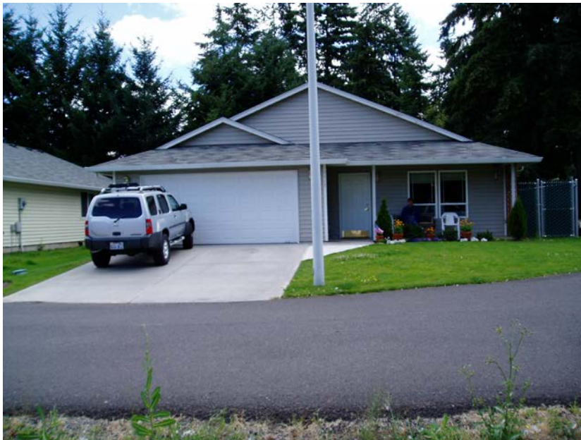
IERR Care Home

Low-interest loan for rehabilitation of owner-occupied houses.