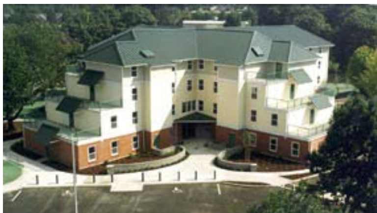
Central Park Place

Construction contingency and operating reserve loan for Covington Commons, a 40-unit apartment complex, including 8 units for the developmentally disabled.