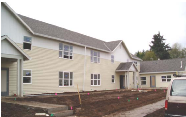
Hazel Dell Senior Housing

Low-interest loan for rehabilitation of owner-occupied houses.