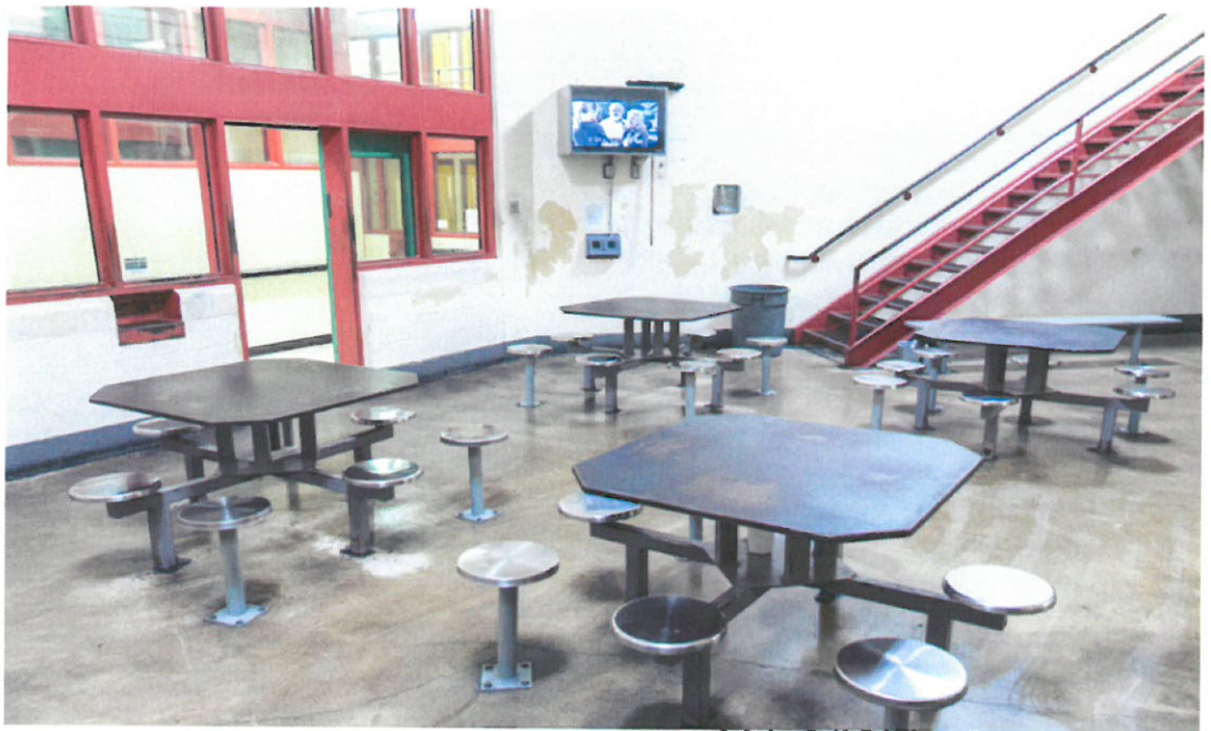
Main Jail Living Area