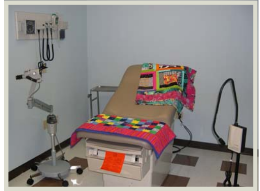
Photo: New examination room on-site with quilts displayed. Quilts are donated by local artists and given to child victims of abuse as a gift during their medical evaluation.

CJC is proud of the new examination room that was made possible with capital funds from the state budget. A very special thank you to Commissioner Marc Boldt who was instrumental in helping CJC make the request to the legislature to fund the remodel project. $100,000 in state funding was awarded to CJC for this project. Construction of the remodel project was completed in June. We are excited about increasing our center on-site services to promote greater sensitivity when exams are needed, along with a comprehensive response.