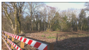
Ground clearing completed at Chinook Park. What's next?