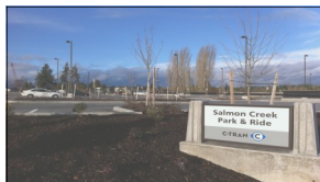
New Salmon Creek Park & Ride opened

Businesses came and went, road construction was completed, gas prices fluctuated, gold skyrocketed, and groundwork was laid for our first neighborhood park. Here are some highlights of 2011—