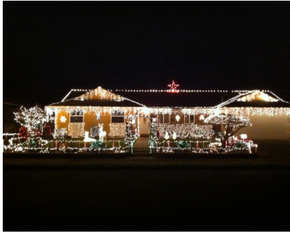
1st Place: The Bozarth Family —709 NE 134th Street.