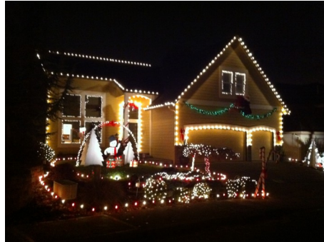
2nd Place: The Castleberry Family—14201 NW 27th Ave.