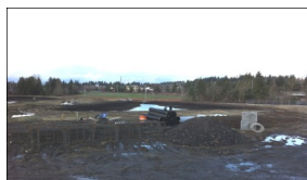
Construction on new storm water ponds in old Park & Ride location

The NSCNA was active this past year in promoting our neighborhoods. We were at various open houses and the farmer's market. We partnered with other neighborhood associations in fundraising for various charities as well. We look forward to a productive 2012, although we have two open director positions so our executive board is running a little thin. In 2012 our plans are to present at least one event for Salmon Creek to bring recognition to the area. We also plan to pursue the postponement of the Chinook Park development (see related article below). Active fundraising for this project has been suspended, however we are always happy to accept any and all contributions to make the park happen.