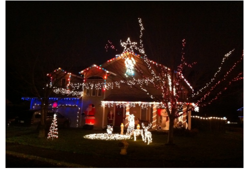
3rd Place: The Finnigan Family—14203 NW 8th Ave.