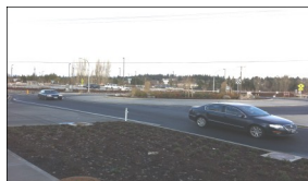
New Salmon Creek roundabout. Love it or hate it?