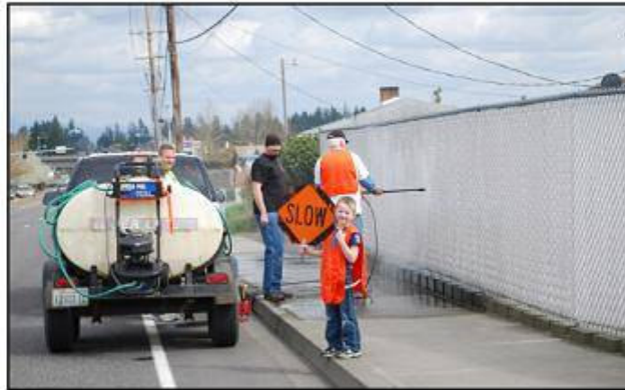
Our youngest volunteer!