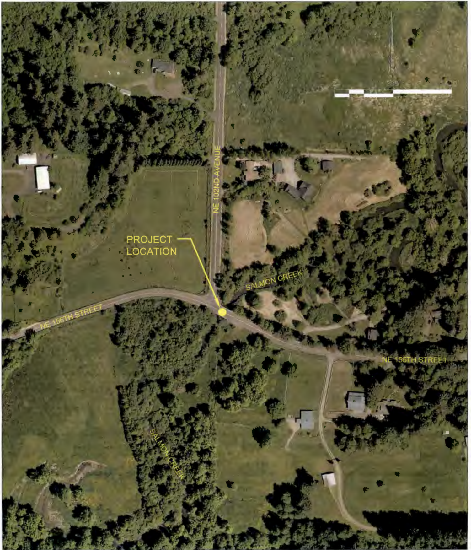
BRUSH PRAIRIE BRIDGE #201 PREVENTATIVE MAINTENANCE