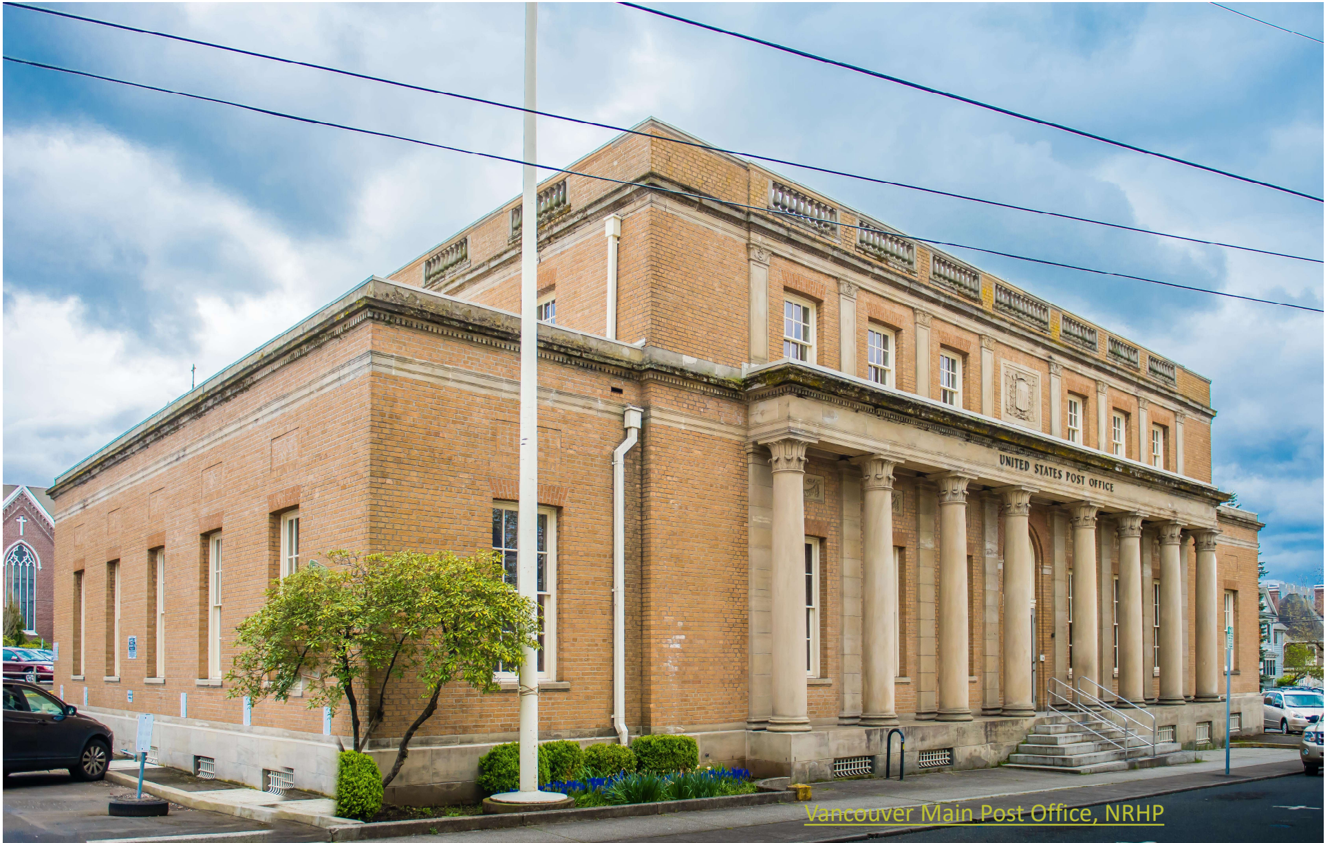
Vancouver Main Post Office, NRHP