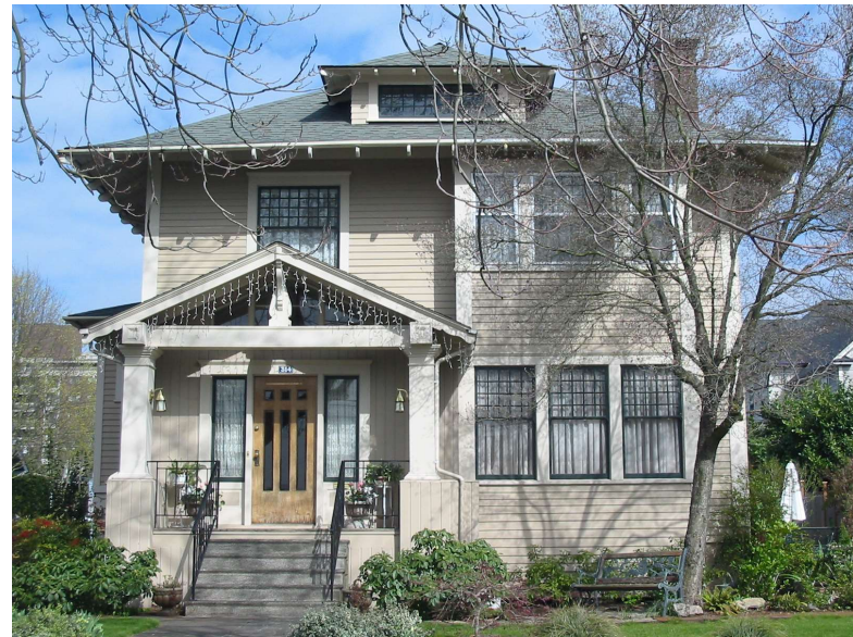
Kettenring House, CCHR