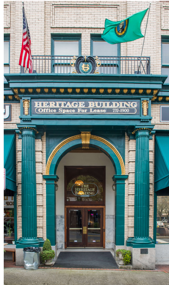
U.S. National Bank Building, NRHP