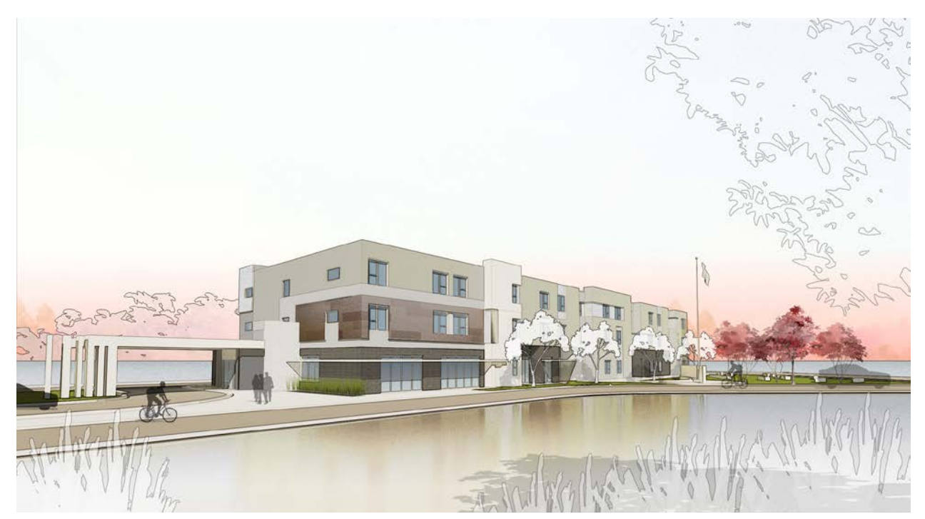
Affordable Housing Solutions - Freedom's Path Housing

Tenant-based rental assistance for approximately 32 households who are at or below 50% of AMFI. Tenants can receive assistance and case management for up to 24 months.