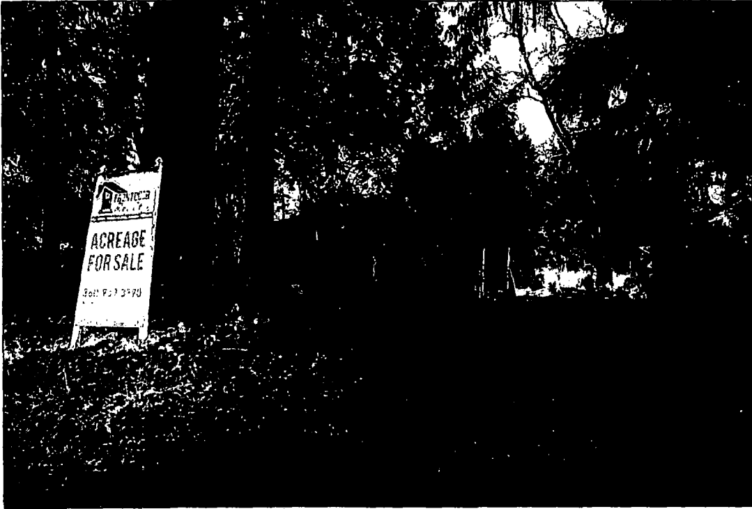
Front View of Subject