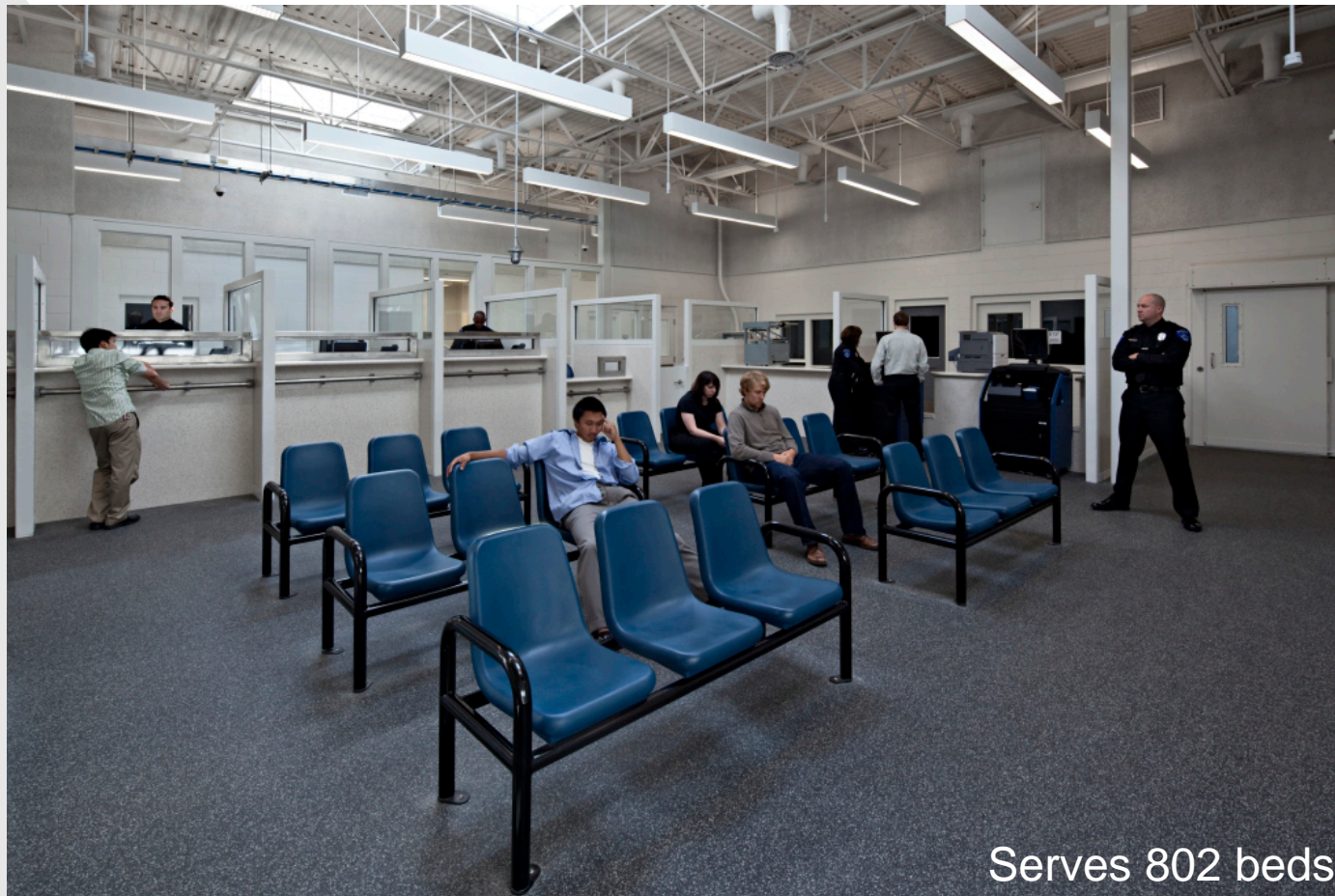
Serves 802 beds