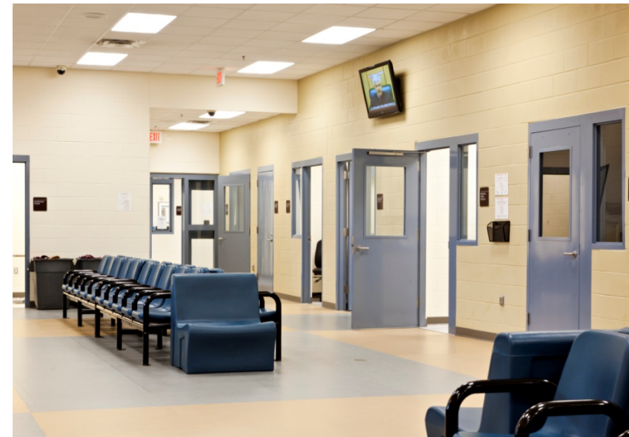
Serves 1,396 beds