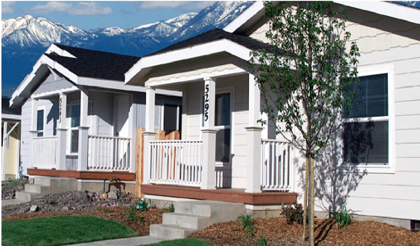
Craftsman Homes – Reno, Nevada