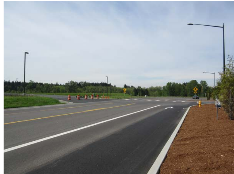
New lane Cowlitz Way facing west