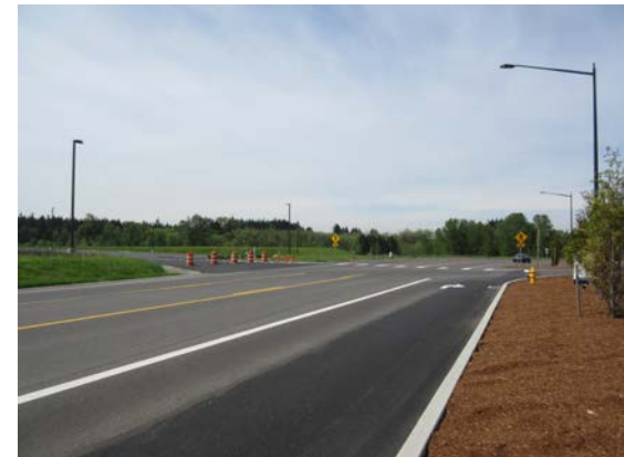
Cowlitz Way facing west