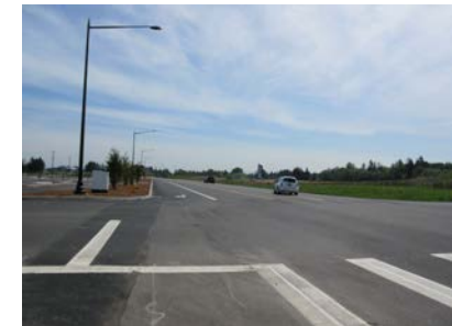
New lane Cowlitz Way facing east