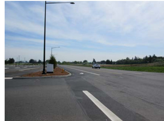
Cowlitz Way facing east