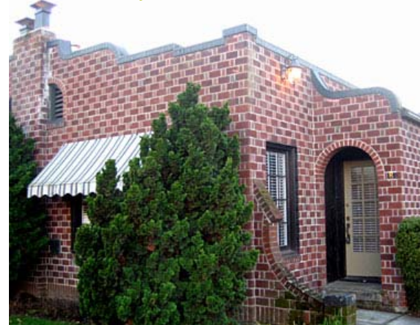
Wisteria Court Apartments , CCHR