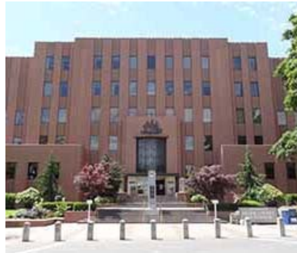
Clark County Courthouse , NRHP, WHR