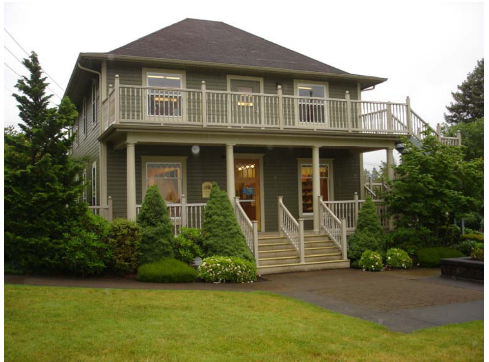
Charles and Frances Zener House