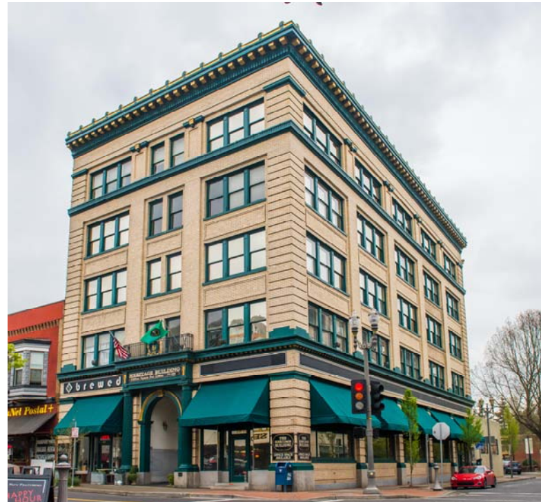
U.S. National Bank Building , NRHP