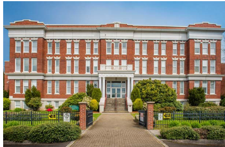
Washington State School for the Blind , NRHP