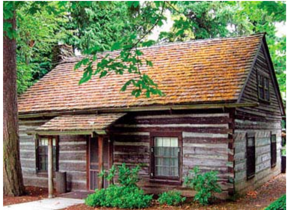
Covington House , CCHR, NRHP