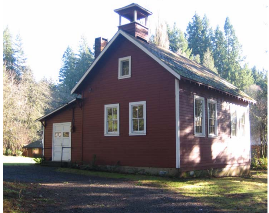
Venersborg School , NRHP, WHR