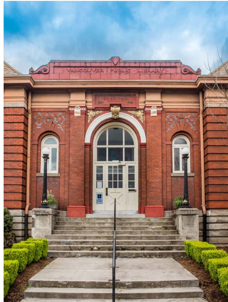
Carnegie Library , NRHP, CCHR