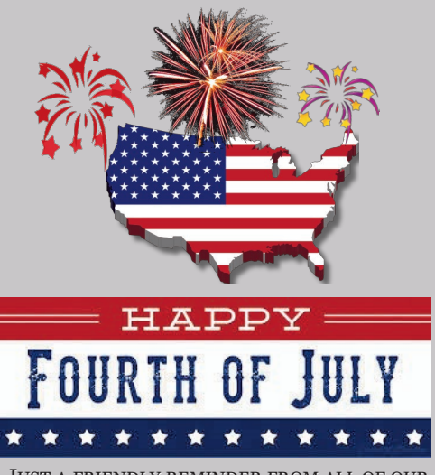
JUST A FRIENDLY REMINDER FROM ALL OF OUR PET LOVING DETENTION OFFICERS:

PLEASE BE AWARE OF YOUR FURRY FRIENDS DURING THE FESTIVITIES.