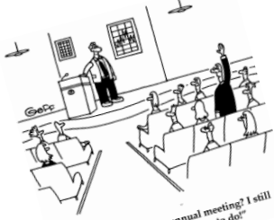
"Could we extend the annual meeting? I still have a lot of complaining to do!"

4 March, 7:00-9:00 pm Walnut Grove School