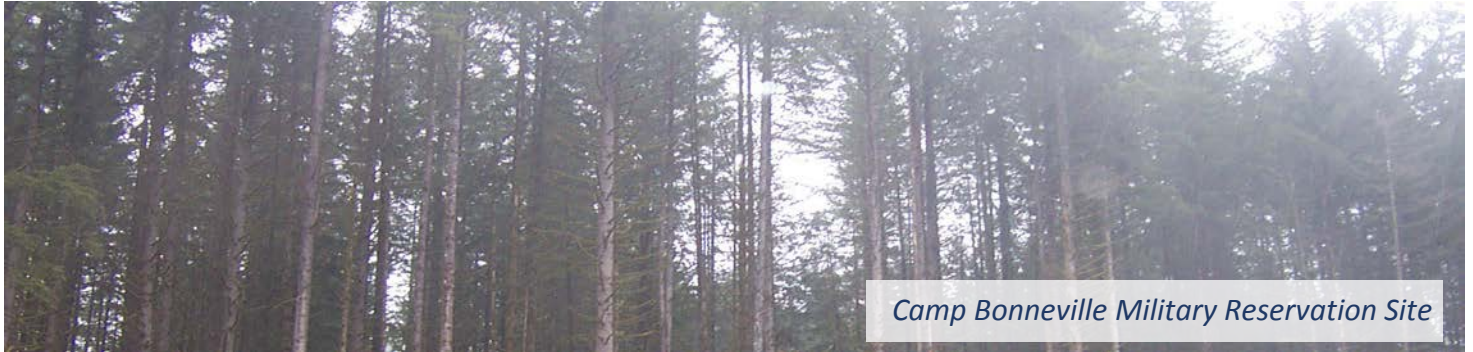
Camp Bonneville Military Reservation Site