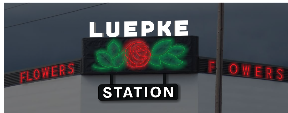
SIMULATED NIGHT VIEW