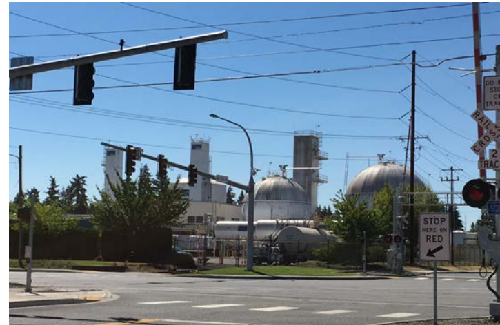
Linde, LLC, NE 47 th Ave/NE 78 th St