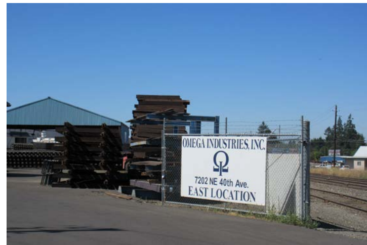
Omega Industries, Inc., NE 40 th Ave.